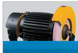
JF-502 Coarse wheel grinding (Size Ø255x19xØ25.4mm)

JF-502 (revised from JF-500) • For shoe's bottom peeling knife & filament cutting knife