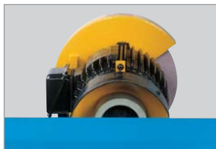
JF-502 Fine wheel grinding (Size Ø100x50xØ15.88mm)